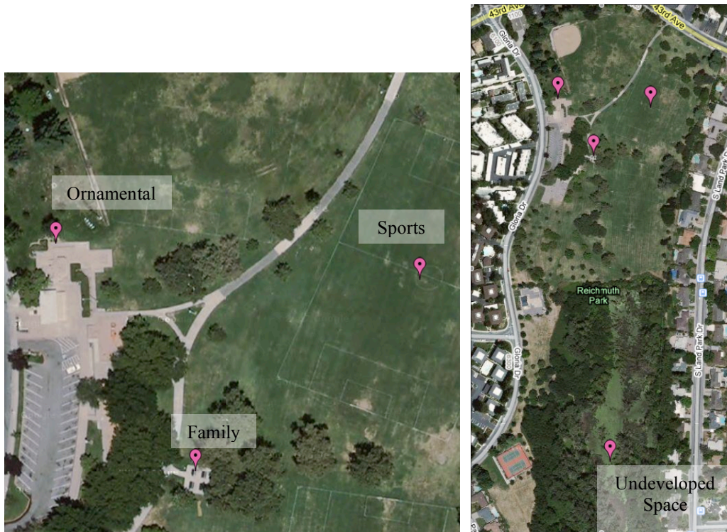
Image 2: Park amenities example at Reichmuth Park, Sacramento Ca. Left: close up of the top half of park.

facilities and undeveloped space had to be verified in large part via Google Maps. The tedious nature of this data gathering process, compounded with the inconsistent presentation of park data across municipal websites, resulted in only forty-two observations being collected for the national sample. The park amenity categories essentially ignore parks that are only manicured fields, parks comprised of geometric cement and greenery elements, and bodies of water. Parks that only feature nature or community centers were not included, except where they did have outdoor elements. Brief descriptions of the park variables can be found in Table 5. Image 2 shows an example of a park as viewed on Google maps, with the four amenities identified.